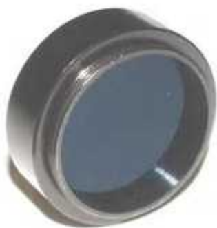
80115 INFRARED LONGPASS (Visible Blocking) FILTER